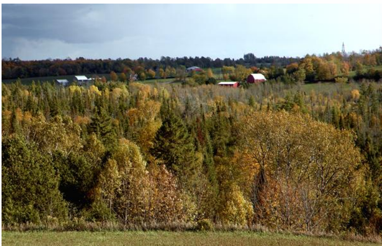
Township Vista