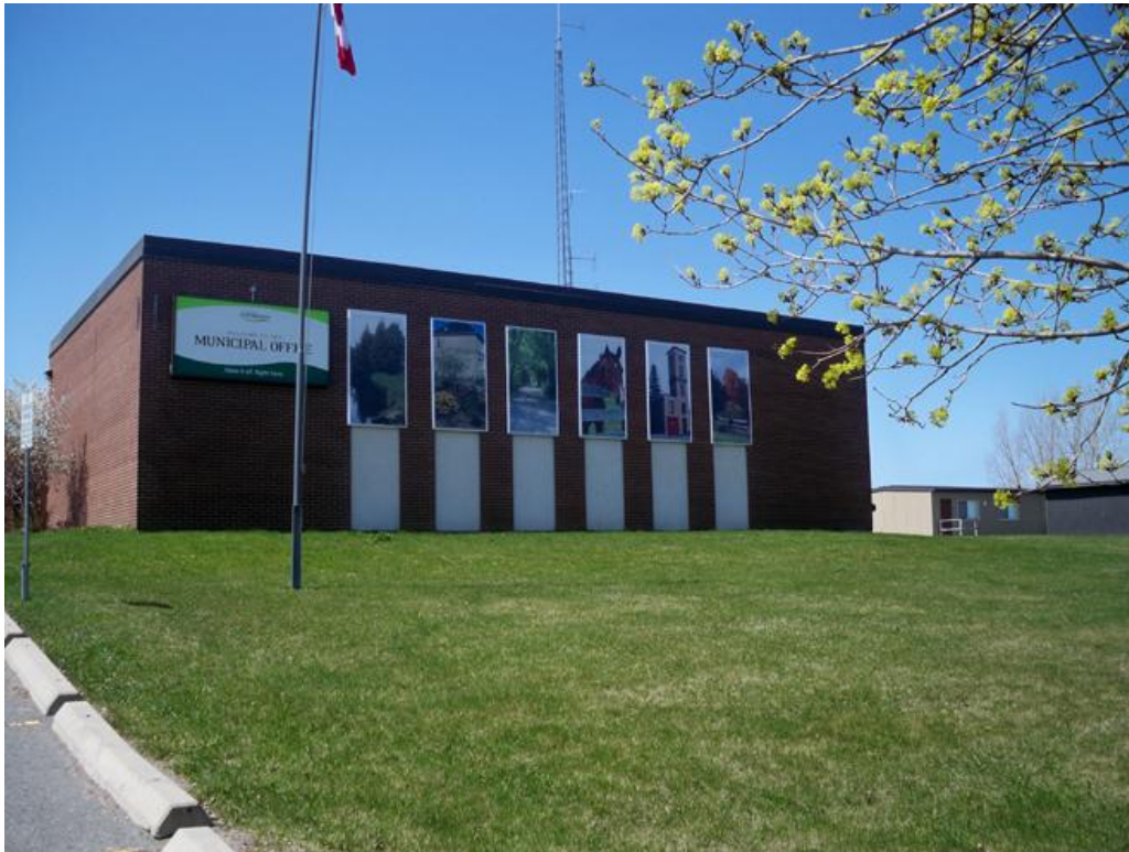
Township of Cavan Monaghan Municipal Office

On the whole, the Township would benefit from a better understanding of the short, medium and long term priorities of each department, particularly regarding the implementation of master plans. While the existing policy framework in Cavan Monaghan provides a solid foundation on which to initiate the strategic planning process, additional planning is still required to ensure the effective implementation of these plans and the rationalization of resources required for this effort. The development and implementation of a corporate strategic plan will assist with this effort.