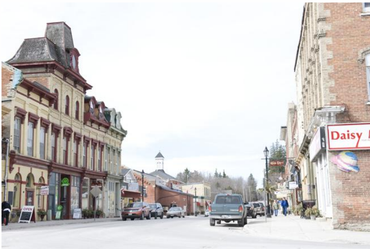
Downtown Millbrook

Ownership of the Millbrook Correctional Facility: While the redevelopment of the Millbrook Correctional Facility has been identified by the community as a priority area for Cavan Monaghan, this site is not under the control of the Municipality as it is owned by the Ontario Realty Corporation. Until the Phase II Environmental Site Assessment (EA) 4 for the property is complete, the Township will have limited influence on the timing of any future use of the site.