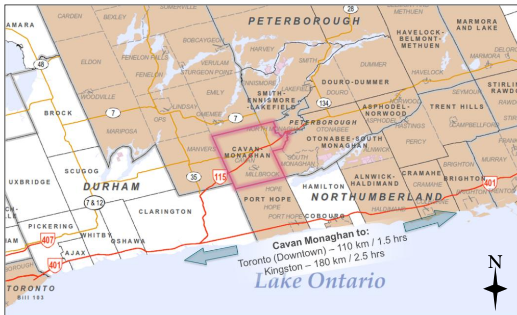
Figure 1: Location Map of Cavan Monaghan