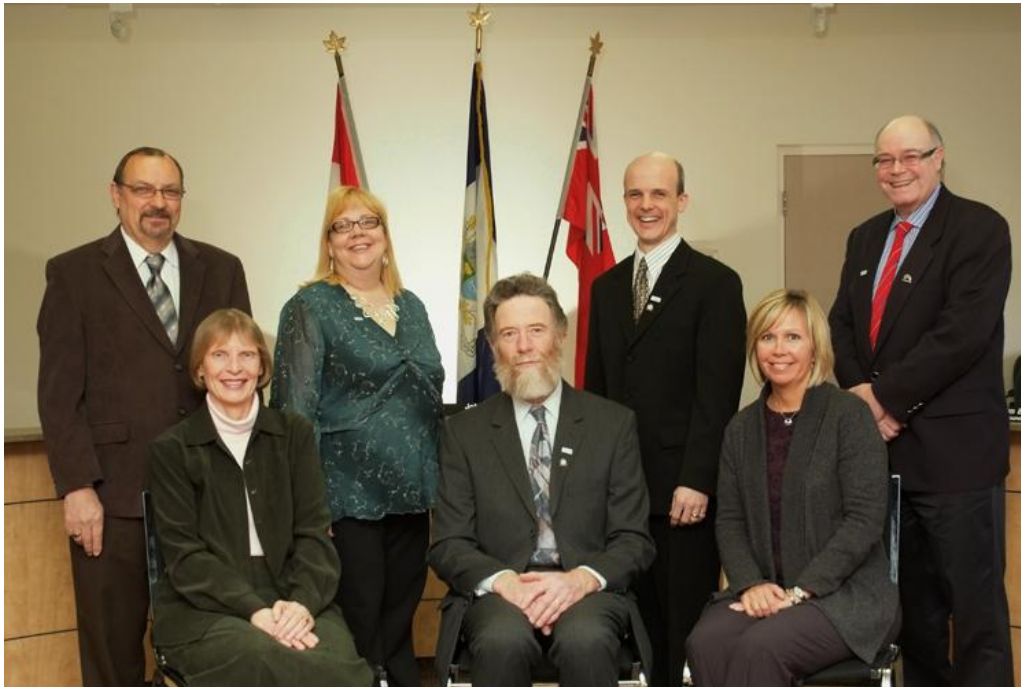
Township of Cavan Monaghan Members of Council & Administration, 2010-2014