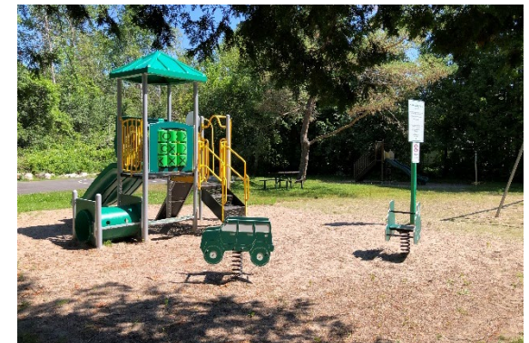
Cedar Valley Park

It is recommended that Township Council endorse the Provision Guidelines for Culture and Recreation Facilities.