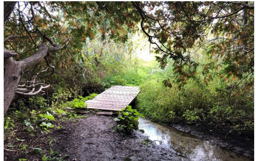
Tributary of Baxter Creek South of Brookside Street

These shifts in priority are reflected in the Belief Statement , the Guiding Principles and the Long-term Vision , as well as the Strategic Action Plan that is presented in this chapter. The objectives and actions associated with the four Strategic Priorities are not listed in priority order. However, a general sense of priority is indicated by the recommended timing for each action and the broad sense of priority implied by the above list of proposed shifting priorities.