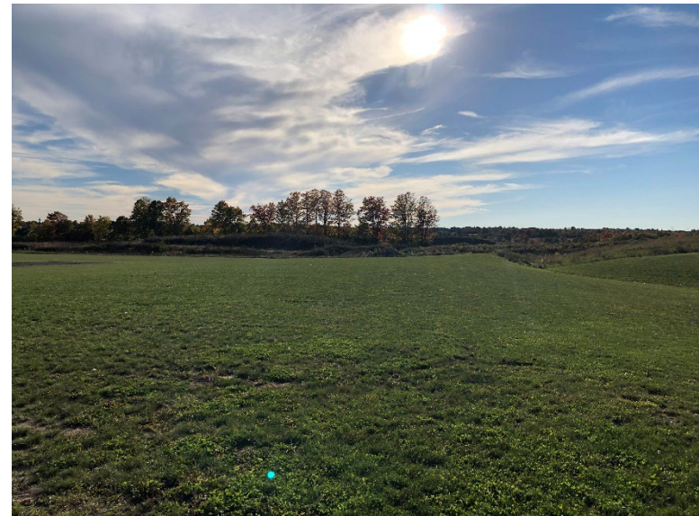
Photos of the remaining lands associated with the Cavan Monaghan Community Centre