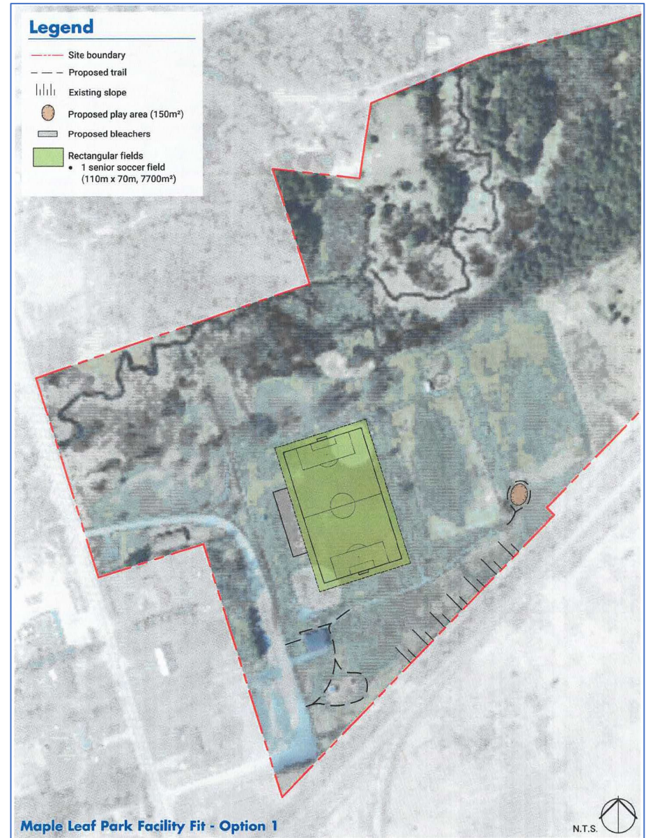
Figure 6-5: Facility-Fit Exercise Illustrating a Full-Size Lit Adult Soccer Pitch Replacing the Ball Diamonds and a Proposed Second Playground

It was also recommended that a conceptual plan be prepared to guide the rejuvenation of Maple Leaf Park, and that improvements be undertaken as demand warrants and resources become available.