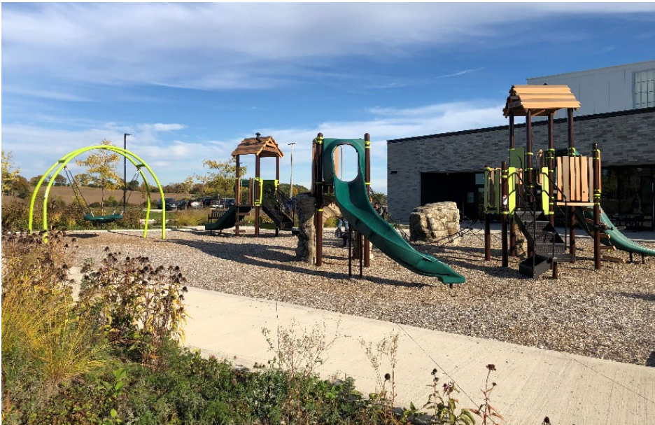
Playground at the Cavan Monaghan Community Centre

Assumption: The population of the township could be around 18,000 by or prior to 2051.