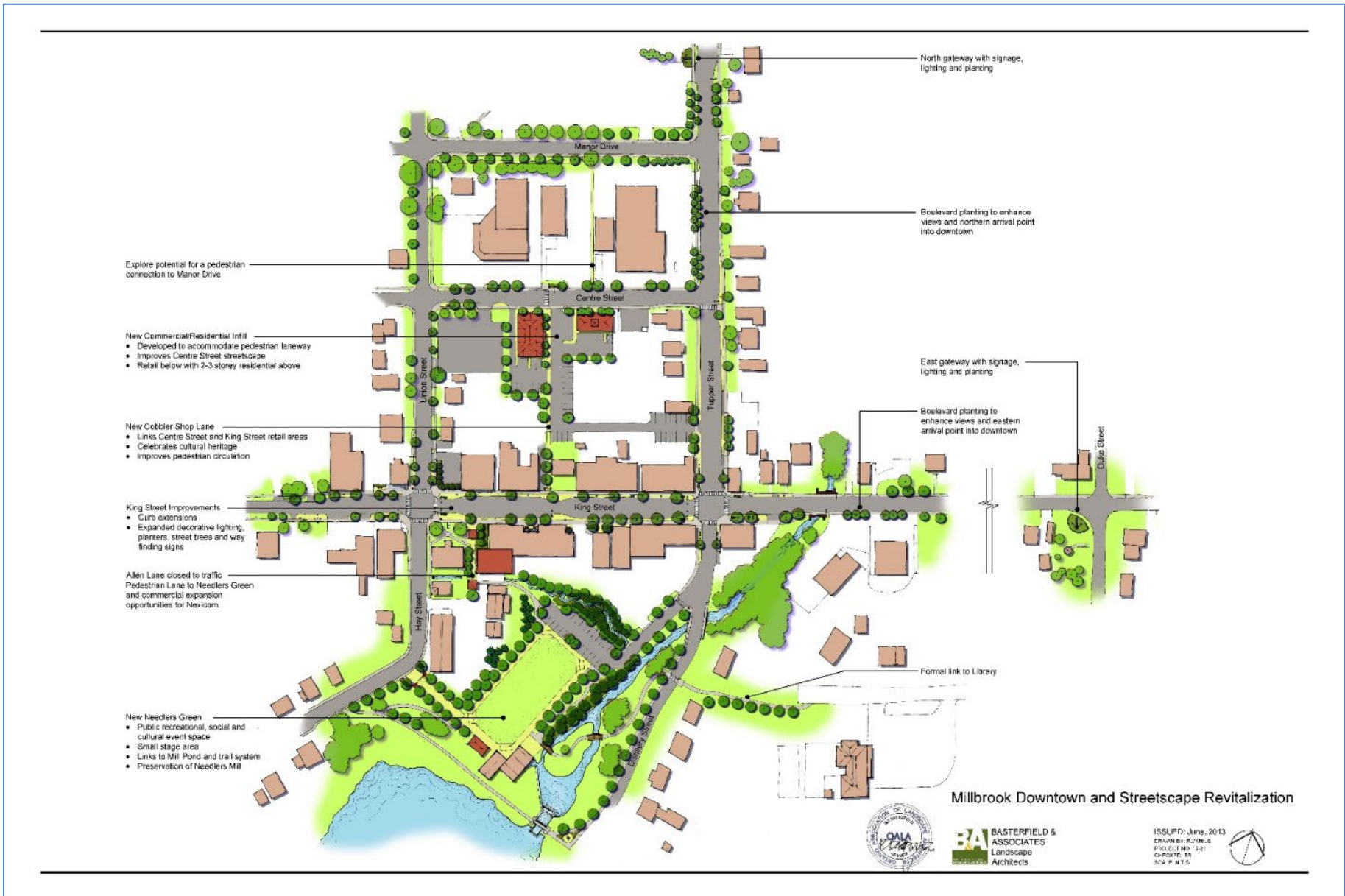
Figure 6-3: From the Millbrook Downtown and Streetscape Revitalization, 2013