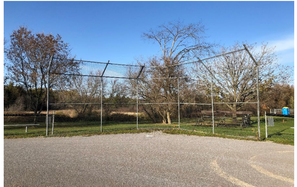
One of the ball diamonds in Maple Leaf Park